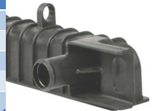
Figure 2: Vydyne® material portfolio for cooling applications

The new Vydyne® R530HR can meet up to 3000h @120°C aging requirement and complete the Ascend material portfolio for Radiator End Tanks.